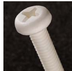
Phillips Pan Head