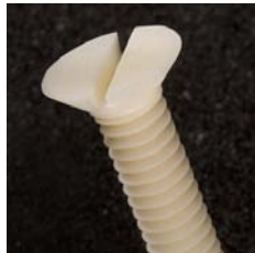
Flat Slotted Head