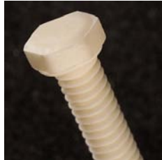
Hex Head (standard head style)